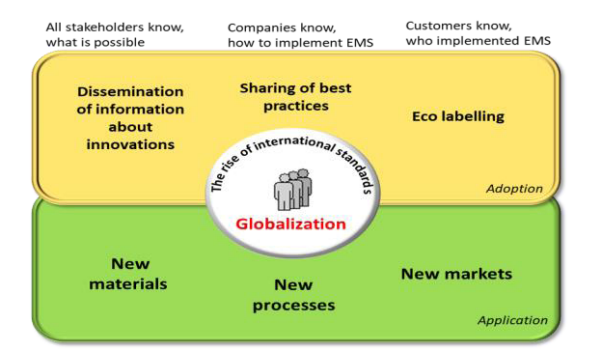
Fig. 5. Model of globalization effects on EMS application

Based on the EMS life cycle model, we derive the model of globalization effects on EMS application (see figure 5). As the first problem for the implementation process was identified, lack of information, which means that all stakeholders (companies itself, their customers and suppliers, regulators, etc.) have to know what is possible. This assumption covers the information about trends in new materials, new processes, and even new market opportunities. The second problem forms uncertainty about how to implement EMS in a particular company. This uncertainty can manifest as the resistance either on the managerial or staff level. The third problem in EMS application is that even if companies claim their sustainable behaviour, consumers have no means to prove this claim. Globalization helped to solve all these problems with the rise of international standards. Environmental protection methods and ways of sustainable behaviour are evolving, but best practices can be shared and applied worldwide due to standardization. Customers in different parts of the world can be assured about this behaviour based on the applied standards and eco labels. We can say that globalization is the core process that enabled the development of an environmental management system worldwide.