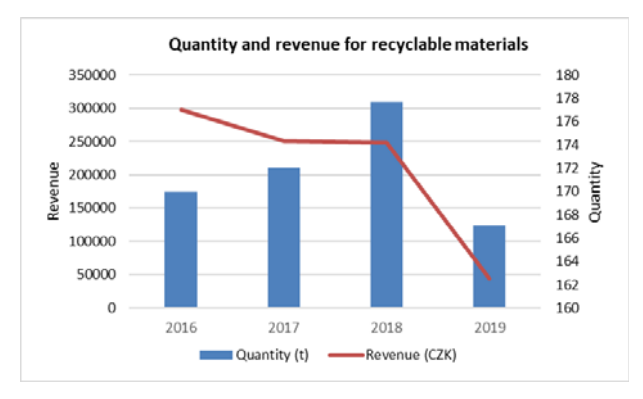
Fig. 7. Progression in the quantity and revenue of recyclable materials.

In identifying the causes, it was found that in June 2019, the company changed an external company to ensure the disposal and purchase of waste. The reason should allegedly be the market's situation in the purchase of secondary raw materials for further processing and the increase in prices for waste disposal. Figure 7 is a visualization of the development of revenues from production plastics in individual years.