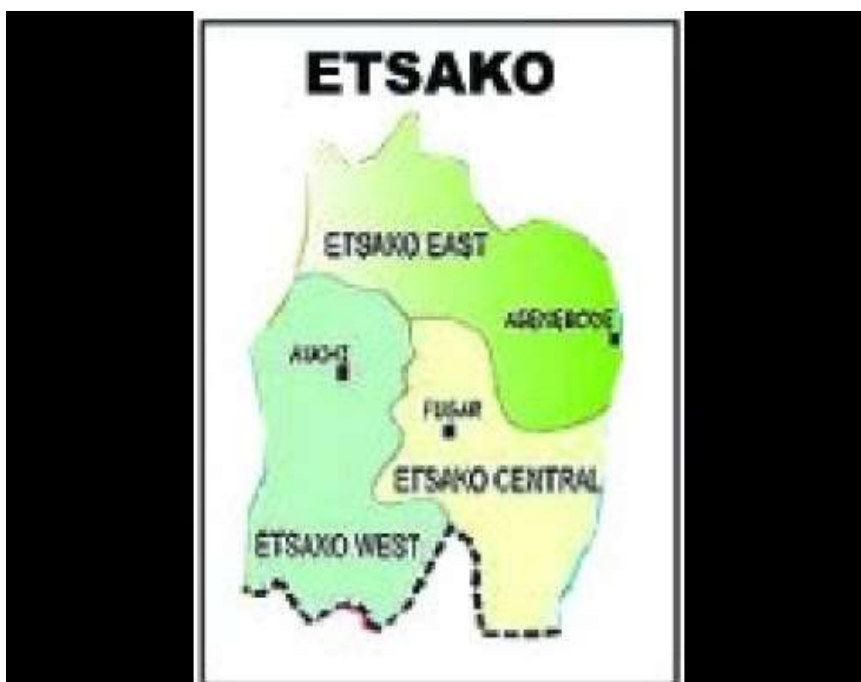
Map of Etsako land showing Auchi in Edo State, Nigeria