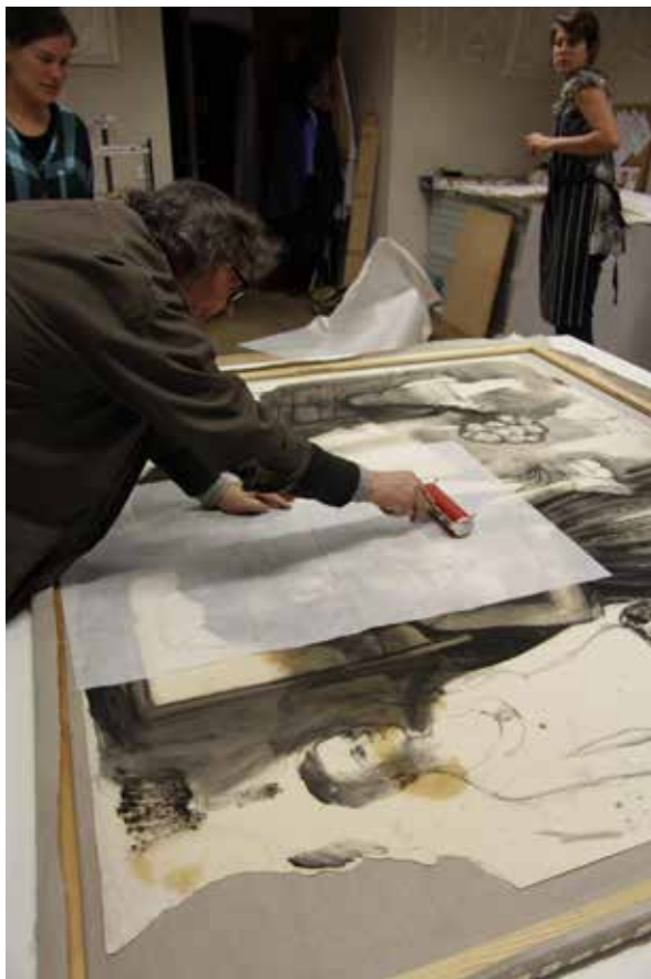
Fig. 5: M. Schmidtová, Narozeniny , the backing of the drawing to the new linen canvas support