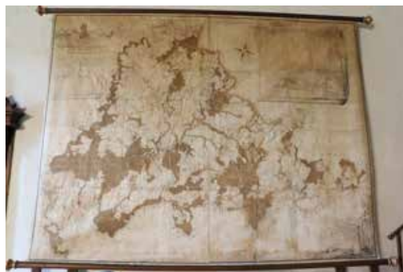
Fig. 7: Map of Náměšť nad Oslavou domain, state of preservation in 2018