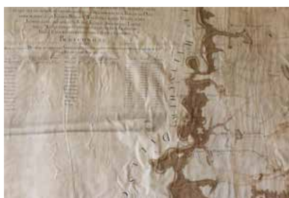
Fig. 8: Map of Náměšť nad Oslavou domain, detail, state of preservation in 2018