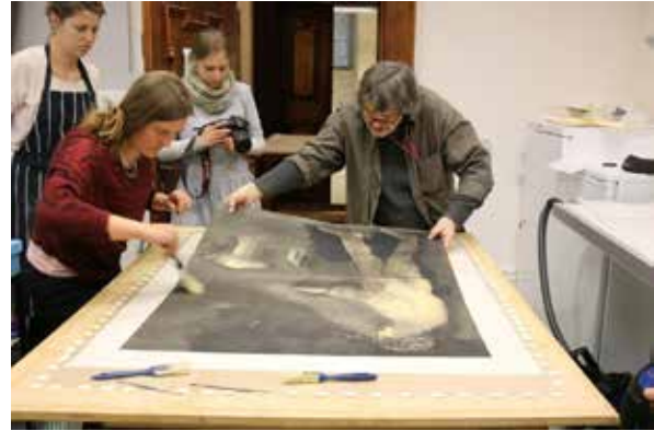
Fig. 4: M. Schmidtová, Na houbách , the backing of the drawing to the Japanese paper support

The adjustment was not meant to be temporary, or prepared just for the exhibition, but a long-term one (Figs. 2, 3). Special wooden panels were made for this purpose, each of which consisted of