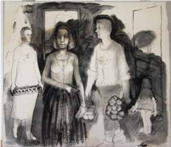
Fig. 2: M. Schmidtová, Narozeniny , after conservation-restoration, recto