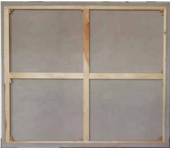
Fig. 3: M. Schmidtová, Narozeniny , after conservation-restoration, verso

materials and media. The conservation-restoration was planned based on the results of the research and included: dry cleaning, fixation of the paint layer, flattening the paper support, as well as local or overall reinforcement with Japanese paper. Infills of losses, retouching and adjustment to a new support were also part of the conservation strategy.