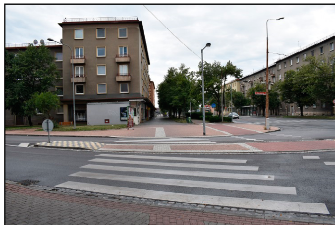
Figure 10. Not signalized pedestrian crossing Macanova St. (photo towards railway station).

street, incl. a pedestrian crossing, is newly reconstructed. The pedestrian crossing is divided into 2 parts for each direction of car drive since this reconstruction (Fig. 10). Pedestrian crossing is equipped by a crossing for cyclists.