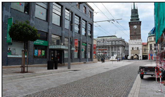
Figure 20. Place for crossing Míru St.

The last place for crossing is the road of Míru St. itself (Fig. 20) with width of 7 m. Signalized pedestrian crossing at the Sq. of Republic (mentioned in also in chapter 6.2.) is located on the left side of Míru St. Crossing on the right side is not possible.