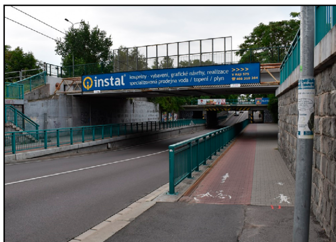
Figure 4. Segment of the 17 November St.

The street of '17 November St.' is led under a set of two bridges. These bridges are creating multilevel crossing with the street 'Hlaváčova St.' and the railway line Praha – Česká Třebová. Pavements (sidewalks) for pedestrian traffic are located at both sides of the 17 November St. in this area. Problem is, that each cycle track is realized as one-way lane for cyclists only due to limited space (Figure 4). Lanes for cyclists located on pavements are marked by a red colour of surface, pictograms of bike and arrows marking allowed direction of cyclists' ride. The problem occurred at this place is based in interaction between pedestrians and cyclists due to relative narrow space.