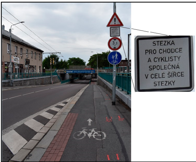
Figure 5. Traffic signs, 17 November Street.

nificant and an adequate application of both of these signs can be helpful for orientation,. Example of this locality (compare Fig. 4 and 5) illustrates this.