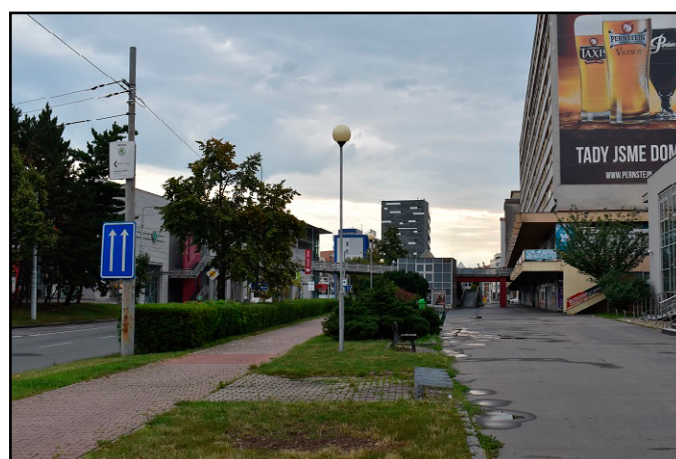
Figure 13. Route segment Havlíčkova St. – 17 November St., the 1 st part.