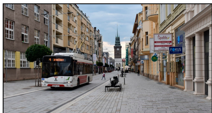
Figure 17. Traffic organization in Míru St. (middle route segment Sladkovského St. – Jindřišská St.).

St. branching to the south (right) in the point of this appraisal. On the other hand, the first two segments have the same conception – it is a pedestrian shopping street by relative width pavements and relative narrow road (for trolleybuses, cyclists and cars with permission only). Cars supplying shops or other objects can enter in limited time frame only. Pavements and the road are on the same level, so that no raised kerbs are used here. This solution allows pedestrian flows to use also the route (if a trolleybus is not going). The way of operation is illustrated by Fig. 17.