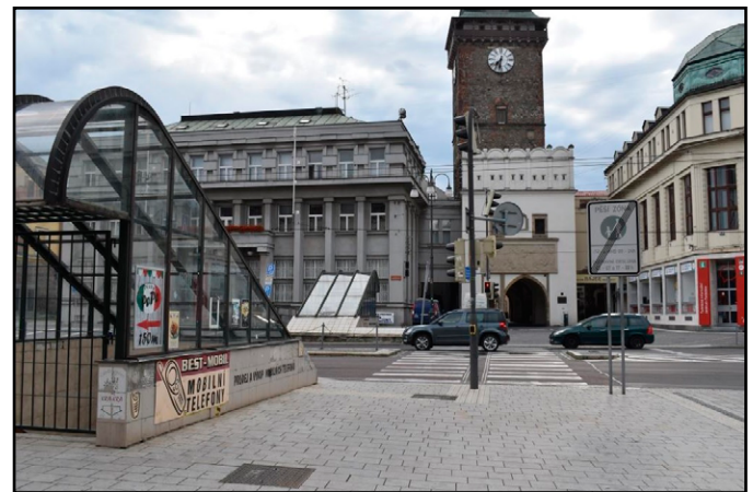
Figure 2. Signalized zebra-crossing together with underpass, Sq. of Republic.

Second locality is signalized zebra-crossing (Fig. 2) located in the Square of Republic in front of historical Green Gate to the city centre. There is also a rush street consisted of 4 lanes separated by middle strip on northern side of crossing. Junction of streets Sq. of Republic and Míru St. is located directly on the southern side of this pedestrian crossing.