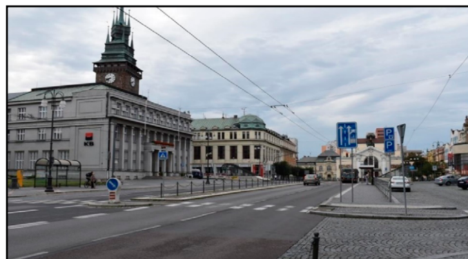
Figure 3. Signalized zebra-crossing (a view of approaching car driver), Sq. of Republic.

The problems with attention in this area can be also validated by a total number of all 124 traffic accidents with 37 injured persons investigated in the area of Sq. of Republic in last 10.5 years UTVM, (2017).