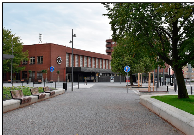
Figure 6. Reconstructed access to the railway station, Jan Perner Sq. (photo towards railway station).

Second problematic fact, which is remaining, is a frequented movement of cyclists going to stands (and tower) for bicycles located in south-eastern part of the Jan Perner Sq. These cyclists are crossing basic pedestrian route to Palackého St. (towards city centre). This intersection is not able to be replaced. New solution of infrastructure allows relative more intuitive and clearly using of it, due to raised grass areas upon the level of pavements (Fig. 6).