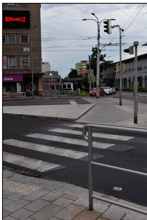
Figure 16. Set of 3 pedestrian crossings (17 November St.), reverse view towards railway station.

Basic features of this set of 3 pedestrian crossings are mentioned in the Tab. 9. Crossings are numbered in order from the main railway station to the city centre (crossing No. 1 is located in forefront in the Fig. 15, crossing No. 3 in forefront in the Fig. 16).