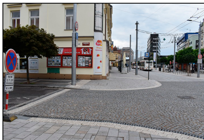
Figure 18. Place for crossing Sladkovského St. (photo towards railway station).

It is necessary to cross three roads by passing on appraised pedestrian route in the locality of Míru St. These crossings are marked as place for crossing (not a zebra-crossing). The first is Sladkovského St. (Fig. 18). This street is used especially by cars accessing Sladkovského St. in direction from north to south. This traffic is almost local, terminating in the areas located southern of Míru St. The length of the crossing is 6 m.