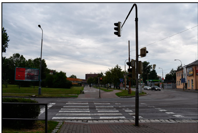
Figure 8. Signalized pedestrian crossing Hlaváčova St. (photo towards railway station).

Interval between green signals for pedestrians was irregular with average length of 100 seconds. The length of green signal is 10 seconds. Average waiting time for pedestrians walking towards the city centre was 45 seconds and towards railway station 40 seconds. Overview of results is provided by the Table 3. It can be seen on these values, that average waiting times are going to a half of duration of red signal. It can be explained in the way, that pedestrians are coming randomly and independently. Random access of pedestrians is presupposed by application of proposed modification of temporal crossing compliance rate MTCCR , see formula (1). Table 3 is providing additional characteristics useful for consideration of pedestrian traffic flow passing this crossing.