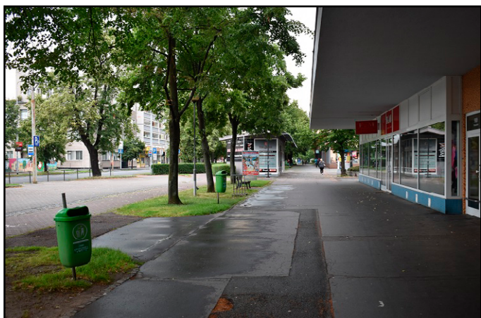
Figure 11. Route segment Macanova St. – Havlíčkova St.