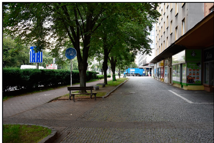
Figure 9. Route segment Hlaváčova St. – Macanova St.

ment belongs also to Palackého St., but route I/36 is diverted now to Hlaváčova St. and the car traffic has city character (transit and freight transport are quite reduced here). Street is also important for urban and regional bus public transport. This segment is interesting by relative high number of obstacles for pedestrians created especially by mobile advertising stands of shops. There is the highest density of obstacles from all the surveyed route segments (2.33 obstacles/50 m).