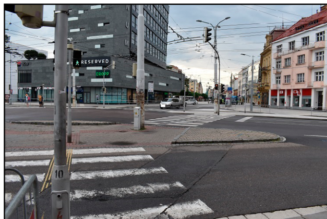
Figure 15. Set of 3 pedestrian crossings (17 November St.)