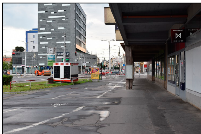
Figure 14. Route segment Havlíčkova St. – 17 November St., the 2 nd part equipped by the lane for cyclists.