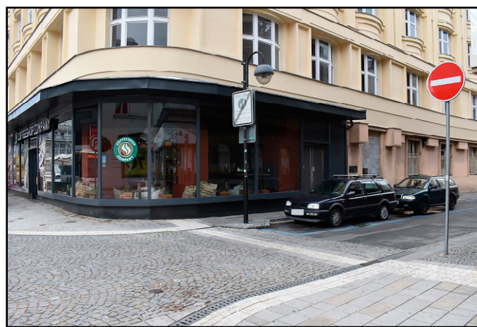
Figure 19. Place for crossing Jindřišská St.

The second street needed to be crossed is Jindřišská St. (Fig. 19). This street is accompanying car traffic from neighbouring area to Míru St. These cars are continuing towards the Sq. of Republic. The volume of this traffic is no problem at the place for crossing. The length of the crossing is 6 m.