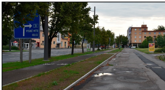
Figure 7. Route segment the main station – Hlaváčova St., a part of Palackého St..

The rest of this segment is copying a car road of Palackého St. Traffic on this street is relative rush, because this is a part a route I/36 as well. Route I/36 is a trunk car road in relation east-west in Pardubice. Configuration of this route segment is visible in Fig. 7.