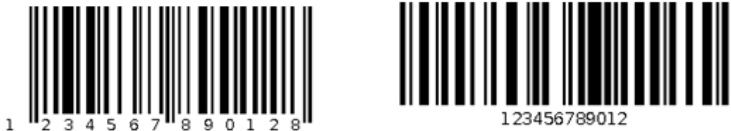
Figure 2: Comparison between EAN-13 and Code 128

nowadays useable. On Figure 2 You can see comparison between two barcode types, which are using worldwide. On this comparison are showed basics barcode characteristics.