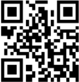
Figure 3: Example of QR code

Worldwide most useable 2D-barcode is so called QR code.[10] Abbreviated from “Quick Respond”, from its development in 1994, when QR code obtain “only” 127 numeric digits, to newest generations of QR codes (7 089 digits, or 1817 Japanese kanji symbols) QR codes usage rapidly grows.