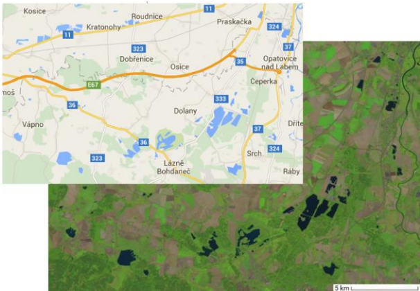
Figure 4. Landsat 8 image of the chosen water bodies

According to Landsat 8 acquisition calendar path 190 is acquisitioned in the 1st day of its 16-day cycle and path 191 is acquisitioned in the 8th day of the cycle. According to Landsat 7 acquisition calendar path 190 is acquisitioned in the 9th day of its 16-day cycle and path 191 is acquisitioned in the 16th day of the cycle. This distribution means 6 days without an image followed by 2 days with images. In the two days the order of paths is switching. It means that the maximum temporal gap between images is 6 days and average gap in 16 days period is 4 days. It is determined without considering influence of percentage of clear water parameter so the values are same for any term (month, year, etc.).