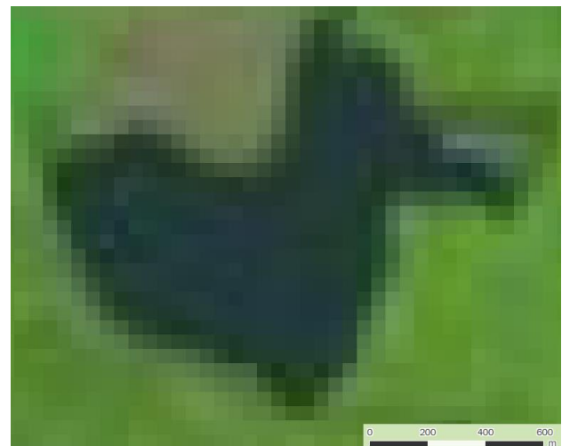
Figure 1. Detail of Pohránovský pond in Landsat 8 image

In Landsat images, there are many influences impairing ideal conditions. It leads to significantly lower number of usable pixels. The papers usually mention problems with clouds, cloud shadows, haze and other various problems. Clouds are the most significant ones from them. The cloud cover is calculated by means of the Automatic Cloud Cover Assessment (ACCA) algorithm for every Landsat image. The percentage of cloud cover is available in metadata for all images. Many of Landsat images have very high cloud cover reaching almost 100%. There are cases where one half of an image is covered completely while the rest of image is clear; i.e., the 50% of cloud cover of image completely covers the whole area of interest or the area of interest is not covered by clouds at all. So, the precise calculations for the area of interest are needed. Cloud cover assessment is not enough detailed and exact factor for determination of applicable pixels even if it is calculated