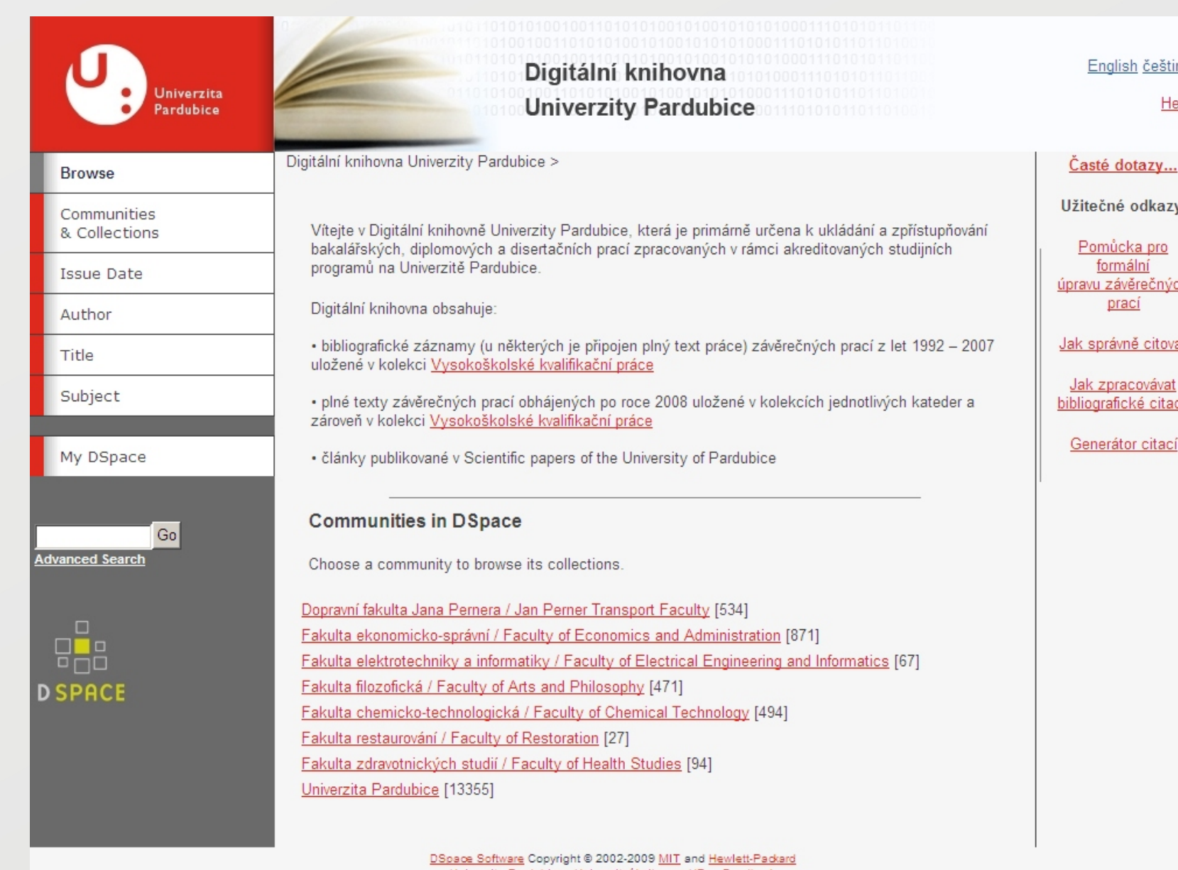
Picture no. 3 Digital Library of the University of Pardubice

University research outputs (only metadata import, full text will be available in accordance with publisher's copyright), testing from the summer 2009