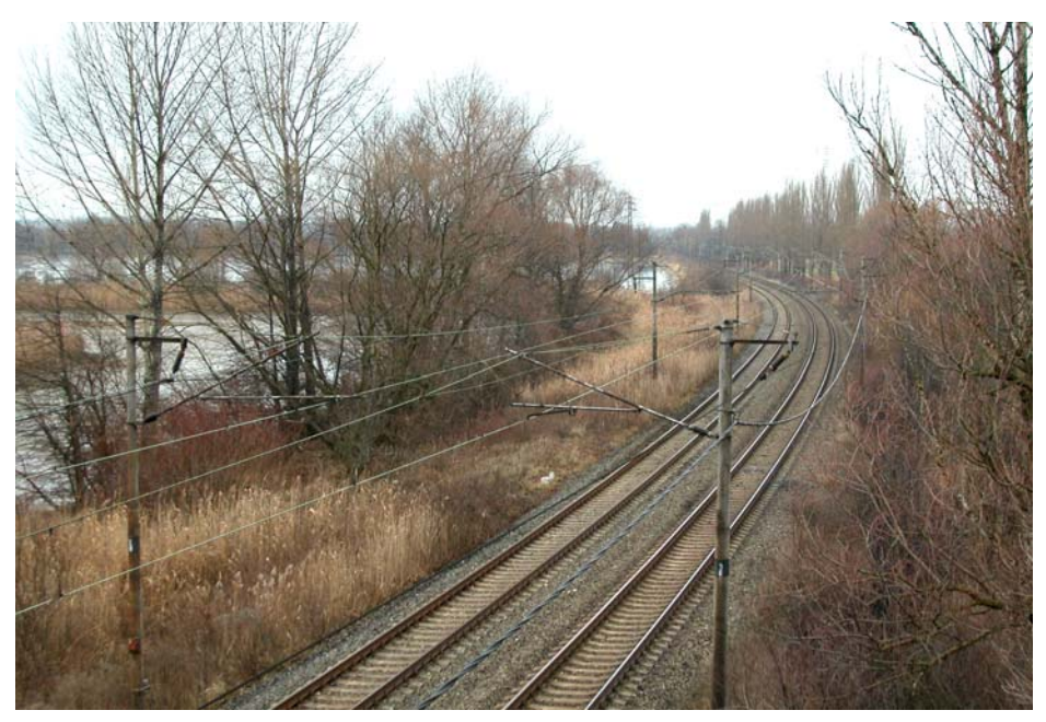
Fig. 2 Between railway stations Karviná and Dětmarovice the railway is located along dams of fishponds (Vdovec, Olšový etc.) – from km 335,650 to km 339,675.

In connection with realisation of construction work it will be necessary to safeguard documenting of access communications including technical condition of bridge objects. It will be necessary to realize the newly built-up access communications as reinforced ones(the reinforcement should be safeguarded equally for usage period of the existing non-reinforced access roads). Equally the installations of construction sites shall be reinforced by concrete panels. It will be suitable to prefer the location of recycling bases within railway plots (on reinforced areas) in sufficient distance from residential built-up area.