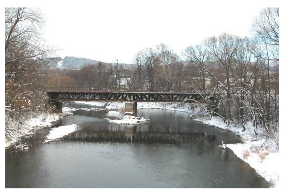
Fig. 1 Bridge across Olše river in Vendryně (km 308,174), which will be reconstructed Obr. 1 Most přes řeku Olši ve Vendryni (dráž. km 308,174), který bude rekonstruován

The first one is a procedure of pulling-down of track bed . As it is indicated by its name at first the track grate is pulled-down in the railway line segment which is subject to construction work The time of construction of one kilometer with this technology takes in average thirteen working days. From the time point of view the total railway line segment during total period of renovating of substructure and superstructure is exposed to effects of truck transport, of proper construction work and of climatic conditions. During a half of period of renovating of substructure and superstructure the construction site and its environs are loaded by intense truck haulage of big quantities of material – the transport demand is about 18 t per linear meter (hereafter Im) of track renovation and all this transport activity must be realised outside the track bed which is being pulled-down. So it takes about 2000÷2500 runs per kilometer of track bed renovation.