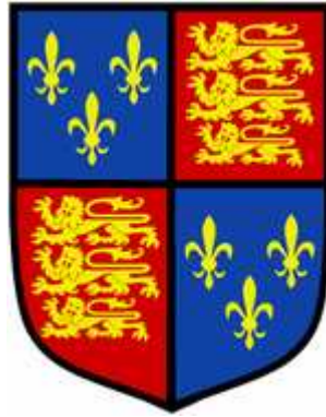
Arms of the Royal House of York