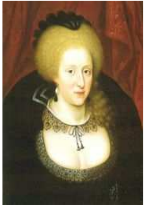
Anne of Denmark, James VI's wife