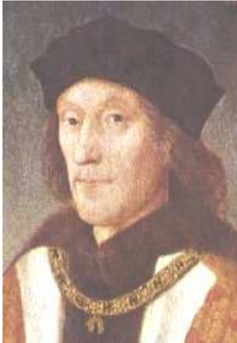
Henry VII, Elizabeth I's grandfather and the first Tudor on English throne