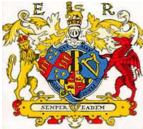
Elizabeth I's arms