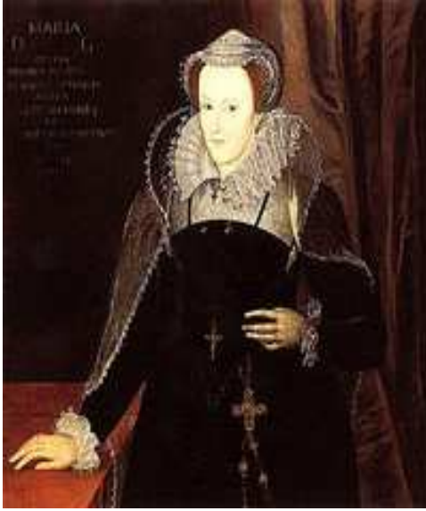
Mary Stuart in captivity, c.1578