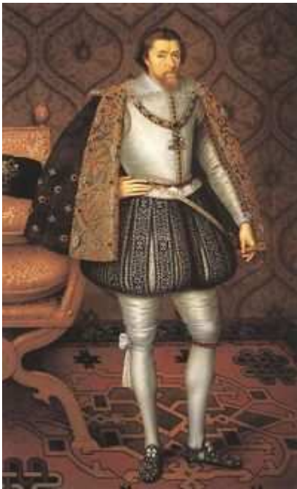
James VI of Scotland and I of England by Paulus van Somer (1603-13)