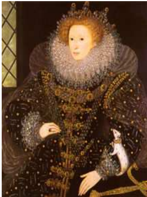
Queen Elizabeth I