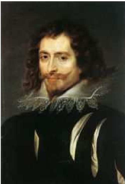
George Villier 1st Duke of Buckingham and James I's lover. Painting by Rubens.