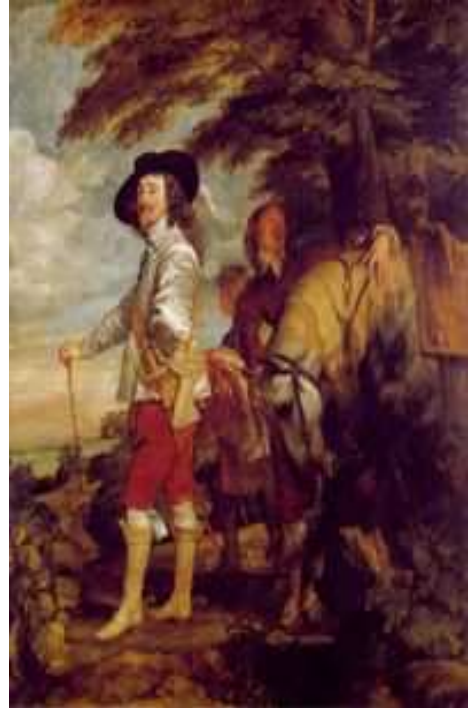
Charles I, James I's son. Painted around 1635 by Sir Anthony Van Dyck.