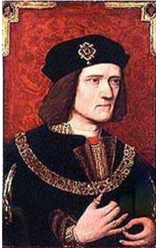
15th century portrait of Richard III