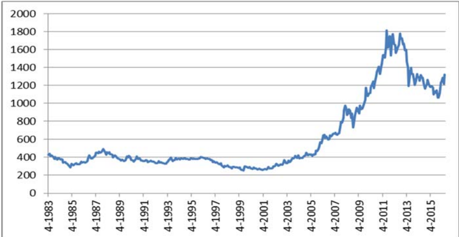
Fig. 2: Development of gold prices (in USD/troy ounce, April 1983 –December 2016)

Gold mining companies, which are mining gold on all continents, contribute to oil supply. At present, the overall level of gold production is stable. The stability of the production results from the fact that the discovered mines mostly serve for compensation of the current production and not for expansion of the global supply. Gold mining takes relatively long time, and therefore supply of gold is relatively inflexible. Gold supply is not able to respond to changing price developments in the short time. Central banks and international organizations hold almost a fifth of the world's mined gold reserves in the form of reserve assets. Each government holds an average 10% of their reserves in gold. Sale of gold is also affected by CBGA (Central Bank Gold Agreement), the aim of which is to stabilize the gold market. Price development of this commodity from April 1983 to December 2016 is shown on the Fig. 2.