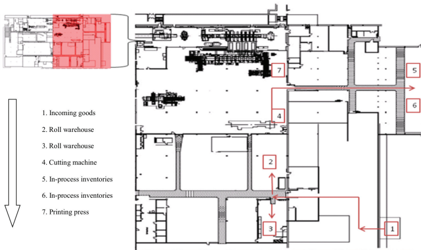
Figure 2: Unoptimized material flow

The established system was designed to sustain and develop the existing work environment. With the use of a questionnaire, the surroundings of the printing press are now reviewed on a monthly basis. The questions are scored in order to quantify the existing conditions, whether they are perceived as improvement and/or regression.