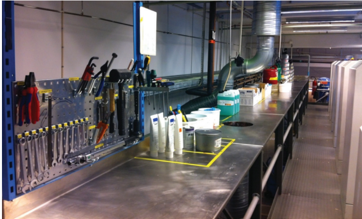
Figure 1: Surroundings of the KBA Rapida 142 sheet-fed offset press

and removed. After this process of selection, it was re-considered whether such materials and devices had been retained in the work area that were integral parts of daily work, and if their quantities had indeed been effectively cut back. For the required tools, expedient storage places were accurately defined and created, while other objects were stored in an easily recognizable arrangement. As a fundamental rule, objects, base materials that were necessary for adjustment or production were placed so that they should become accessible in the quickest and shortest way. Figure 1 demonstrates the working environment of the KBA Rapida 142 sheet-fed offset printing press. Following the completion of the 5S process, only the necessary tools remained in the work area, in ergonomic, visually recognizable arrangement.