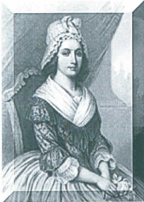
Catherine Maria Sedgwick ( 1789-1867)