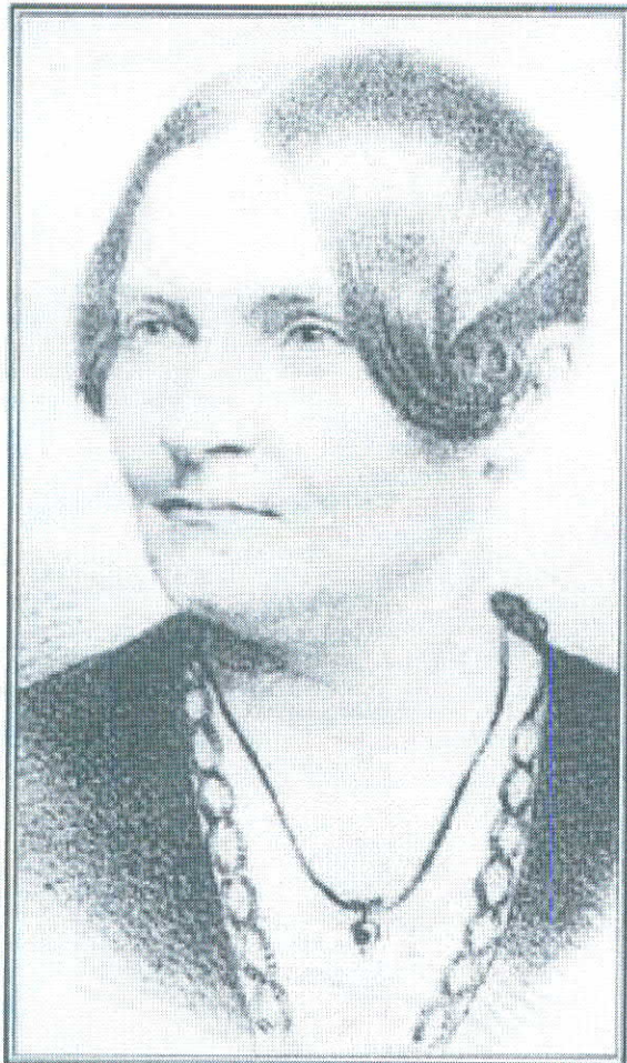
Lydia Maria Child (1802-1880)