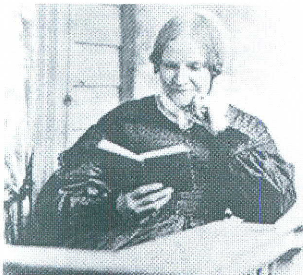
Enclosure number 4 taken from < www.womenshistory.about.com/Child >.